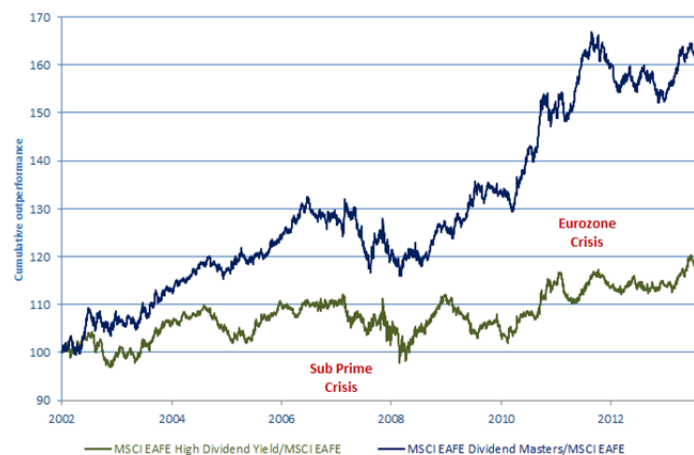
Relative Performance of MSCI EAFE Dividend Masters Index and MSCI EAFE High Dividend Yield Index (USD)