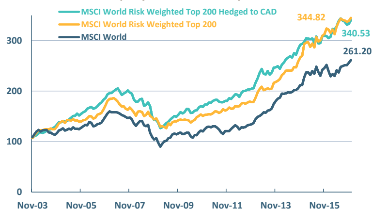
Net Returns of the MSCI World Risk Weighted Top 200, the MSCI World Risk Weighted Top 200 Hedged to CAD and the MSCI World Indexes (CAD) (May 2003 – Dec 2016)