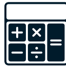
Exposure to governance concerns